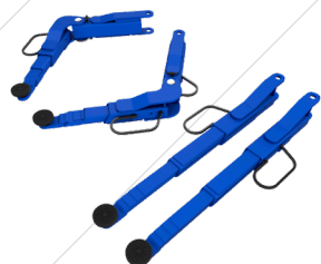
VARIANTS OF ARM CONFIGURATIONS (MODEL CONFIGURATIONS)