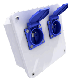
VARIANTS OF ELECTRO BOXES (ACCESSORIES)