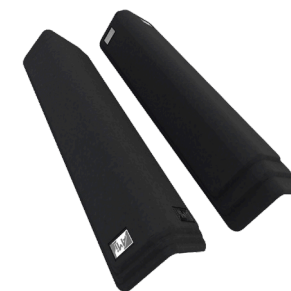
TROLLEY COVER "PUR3" (STANDARD)