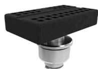
VARIANTS OF VULCANISED PADS AND ADAPTERS (ACCESSORIES)