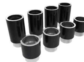
SET OF EXTENSIONS 50 mm | 100 mm (STANDARD)