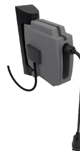
ELECTRIC REELS (ACCESSORIES)