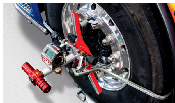
Laser head and electronic inclinometer