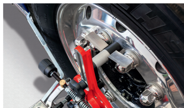
Retaining clips for aluminium rims