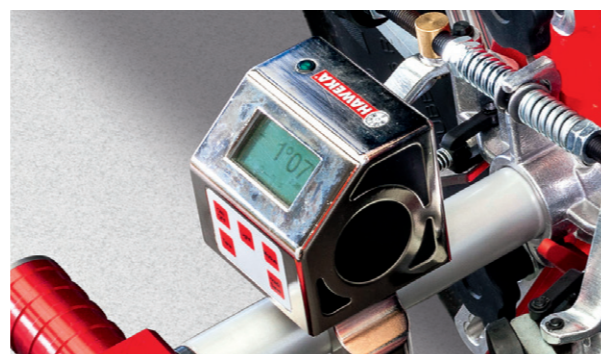
Inclinometer (electronic inclinometer)